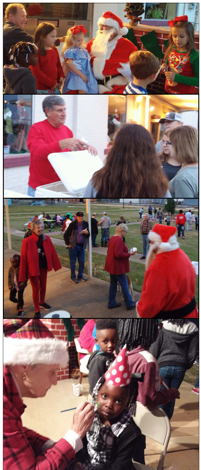
See more pics on Turkey Creek Festival's Facebook page.