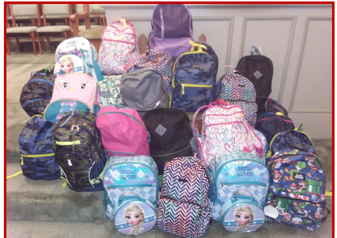
33 Backpacks For Appalachia and 36 Operation Christmas Child Shoeboxes