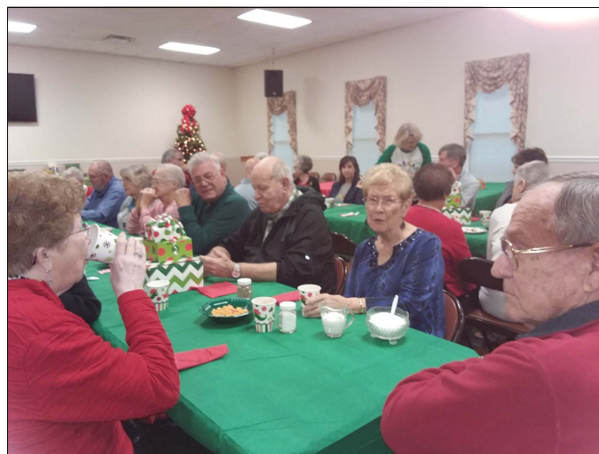
A photo from the Senior Adult Christmas Brunch on December 7 hosted by the GEMS. To see more pictures from December, visit our Facebook page.

For more associational activities and events, visit www.houstonbaptist.org .