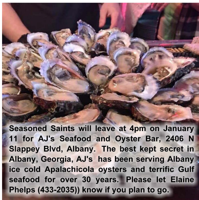
Seasoned Saints will leave at 4pm on January 11 for AJ's Seafood and Oyster Bar, 2406 N Slappey Blvd, Albany. The best kept secret in Albany, Georgia, AJ's has been serving Albany ice cold Apalachicola oysters and terrific Gulf seafood for over 30 years. Please let Elaine Phelps (433-2035) know if you plan to go.