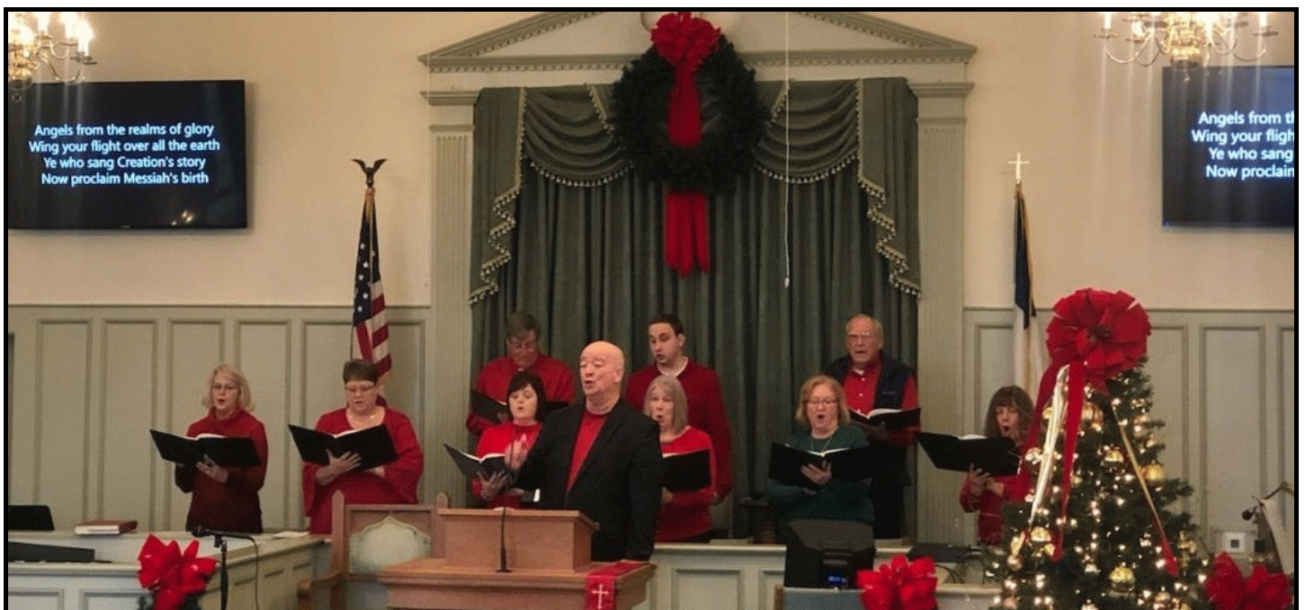
The adult choir presented Noel: Born Is The King during the December 19th 11am worship service.