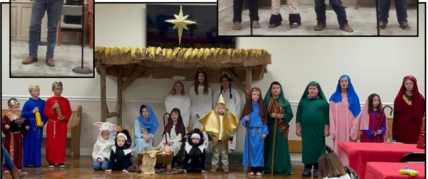
The children provided a Live(ly) Nativity in Saliba Hall on December 10 at 6:30pm.