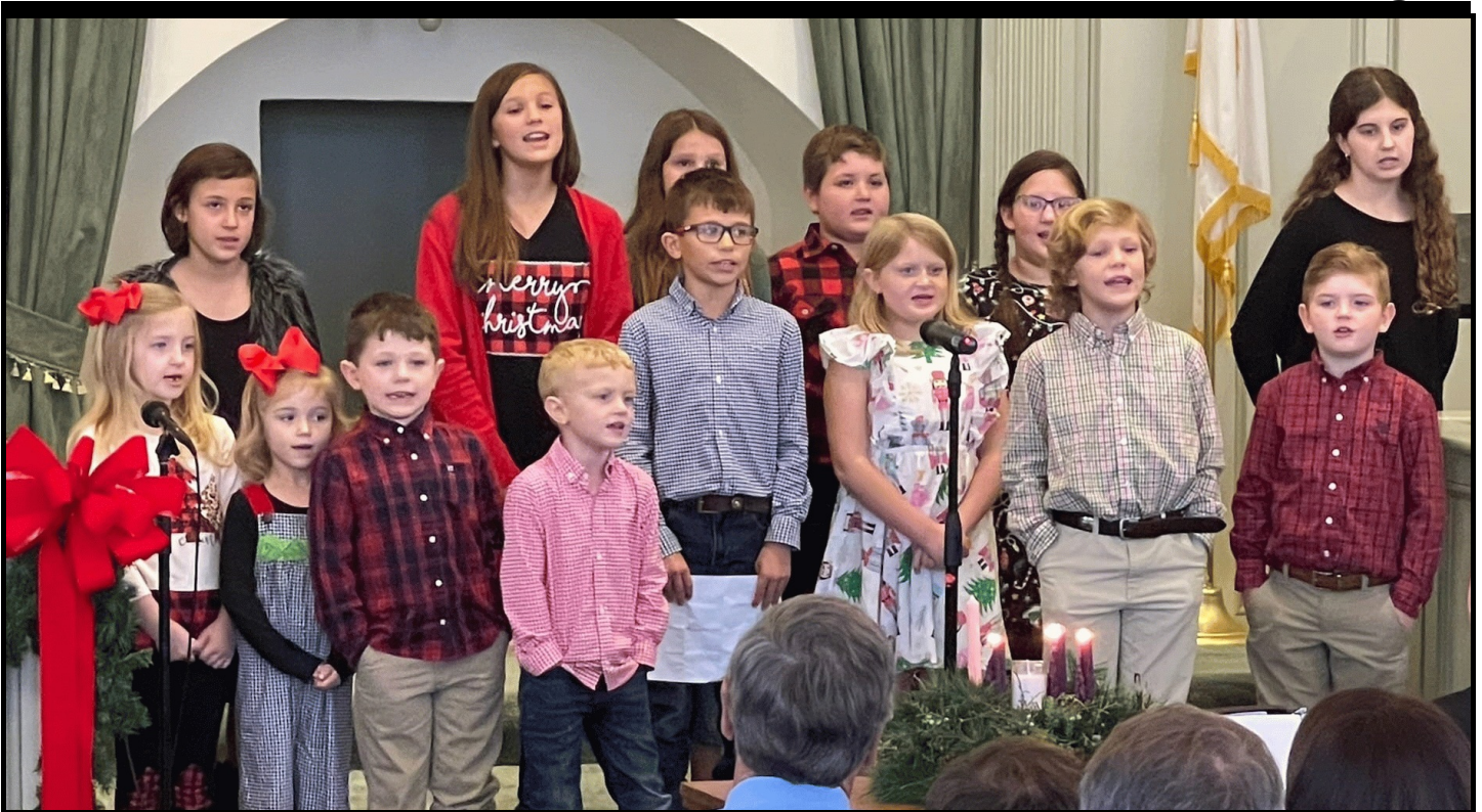
The children's choir sang four Christmas songs for the special music in the December 12th 11am worship service.