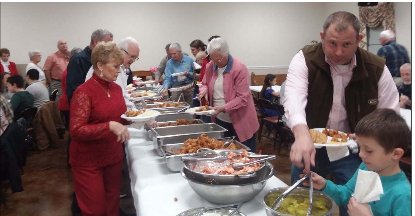
A really good crowd attended the Valentine Banquet on February 9. Thanks to our social committee for planning this scrumptious event.