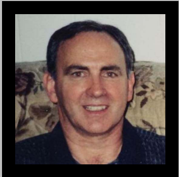
Raymond Beach July 11, 2017